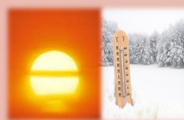
Bad weather conditions