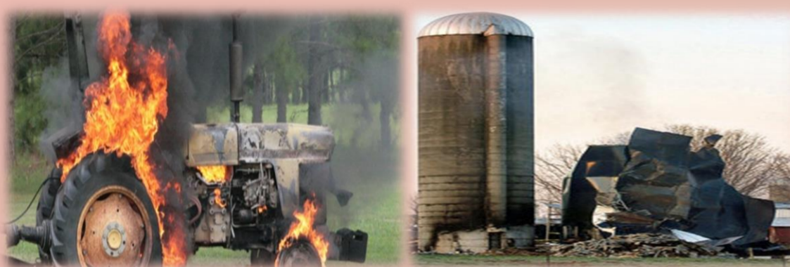
Fire and explosion