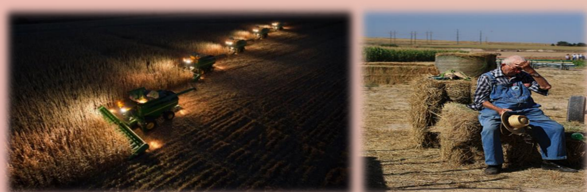
Physical and mental overload