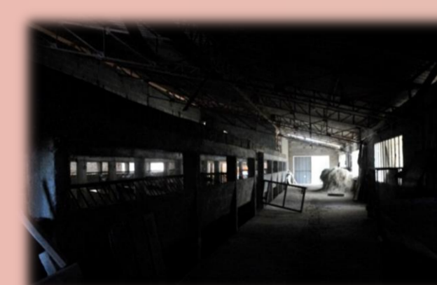
Poor lighting farmsteads